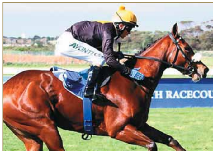
Jet Set Go (ex Azabu Park).

We have her Al Mufti daughter A Shiba with us on the farm, she also had a few issues but safely in foal to Oratorio so holding thumbs they both give me foals this year."