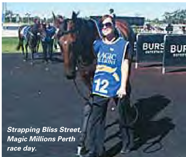
Strapping Bliss Street, Magic Millions Perth race day.