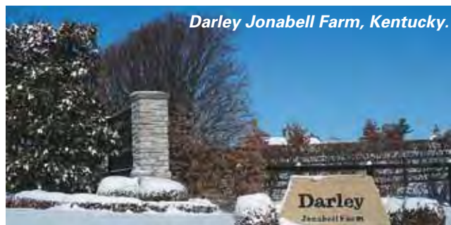
Darley Jonabell Farm, Kentucky.

Along with our morning work and classes, we also have the chance to visit a number of breeding farms and training centres which has been a highlight of my time here in America. Kentucky is home of the thoroughbred in the US, so to be able to meet stallions such as the record breaking Tapit, having tours on historic farms such as Calumet, Lanes End and Three Chimneys has been amazing. During my veterinary rounds as part of our monthly schedule I even had the chance to meet the legendary Zenyatta! The facilities are second to none and the farms are just as they look in the pictures, with the rolling hills, horses frolicking in the beautiful Kentucky bluegrass and those white painted fences that just seem to go for miles. I won't lie the winter was tough with -28 degrees Celsius weather and working outside in the bitter wind, cold and snow, but it was well worth the wait to see the place suddenly turn green with a