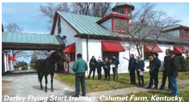
Darley Flying Start trainees, Calumet Farm, Kentucky.

The Darley Flying Start applications opened for another