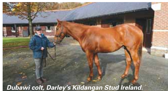
Dubawi colt, Darley's Kildangan Stud Ireland.

The two year programme sees the 12 of us begin our travels with three months in Ireland before 6 weeks in England and after the Christmas break, six and a half months completing a breeding season in America (which is where we will be based until the middle of July this year). After our 'summer' holidays - or winter according to