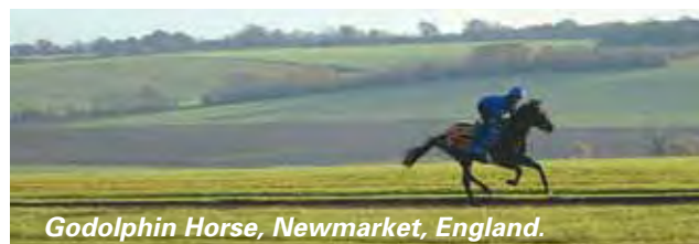
Godolphin Horse, Newmarket, England.

Or follow us on Twitter and Facebook and be sure to subscribe to our Darley Flying Start Youtube Channel for regular updates during each phase of our travels.